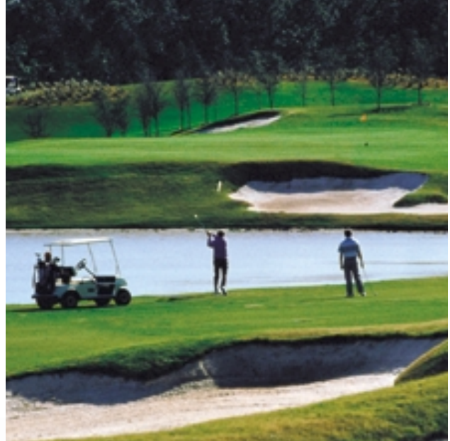
Take a swing at one of Disney's five championship golf courses.