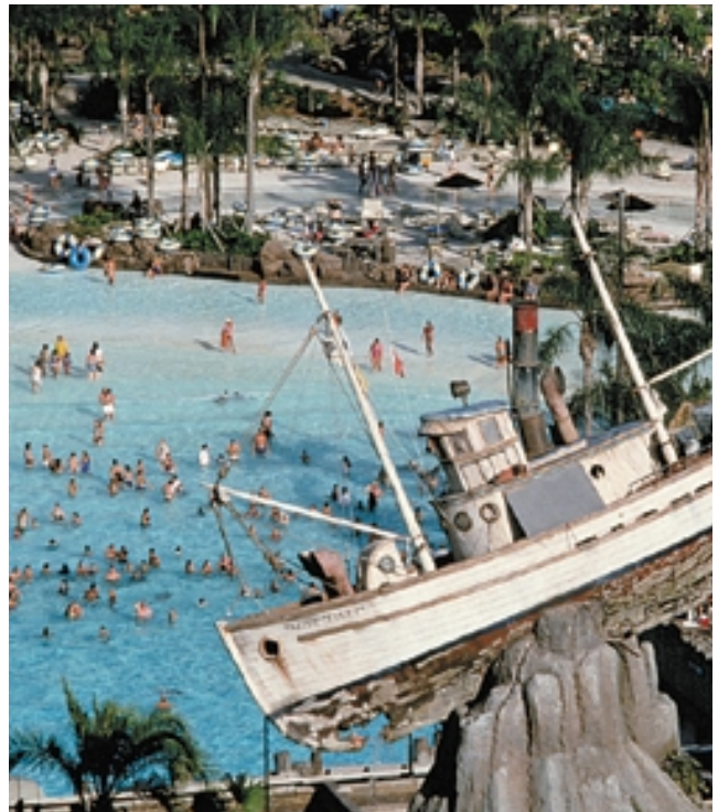
Jump in – everything's fun at Disney's three incredible water parks. Your group can ride the slides, waves and rapids, or just relax on sandy beaches.