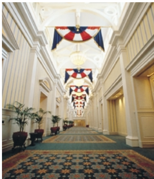
The Grand Harbor Lobby carries the New England flavor of the resorts.