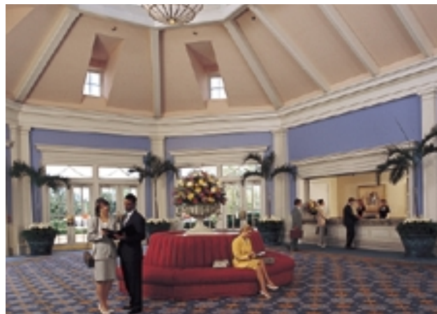
Our spacious Asbury Rotunda and registration desk.