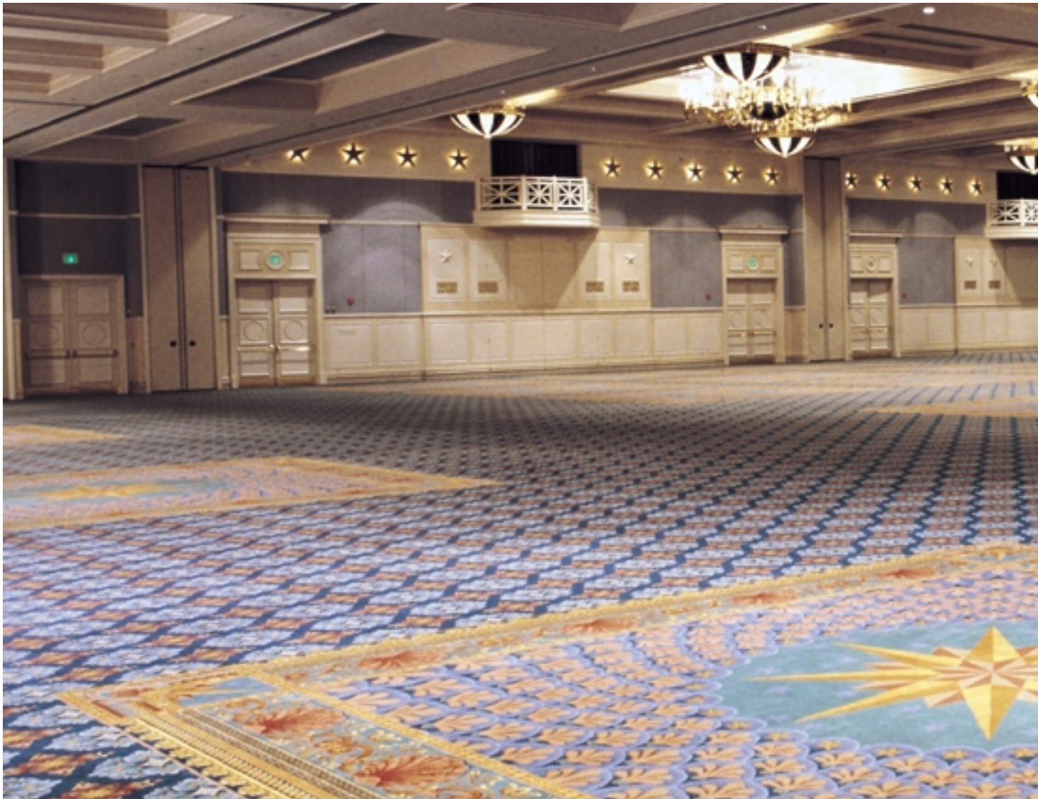
Our Grand Harbor Ballroom: 38,000 square feet of unencumbered open space is ready for anything from a business meeting to an elaborate stage show.