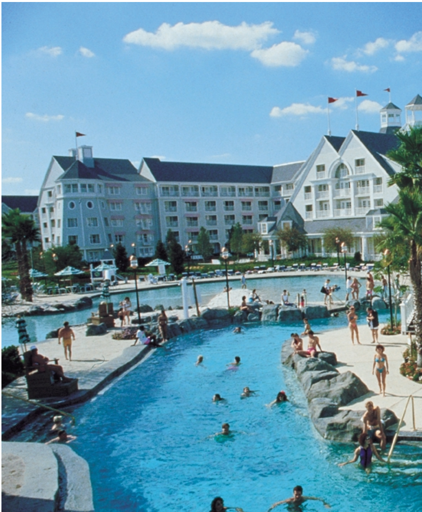
Stormalong Bay: our 790,000-gallon sandy-bottom fantasy lagoon.