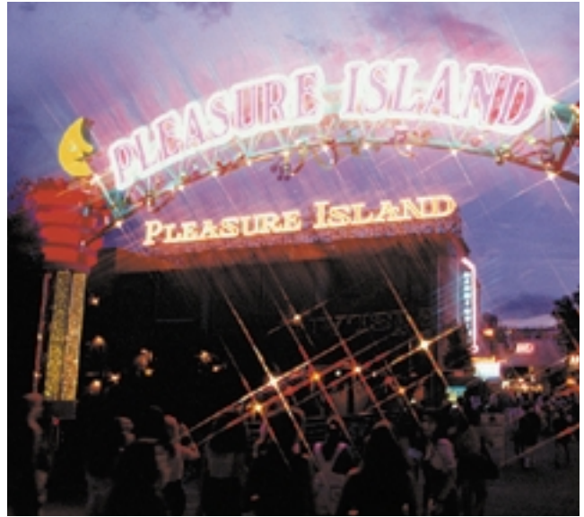
At Downtown Disney Pleasure Island your group is in for non-stop fun: spectacular nightclubs, stage shows, and nightly New Year's Eve celebrations.