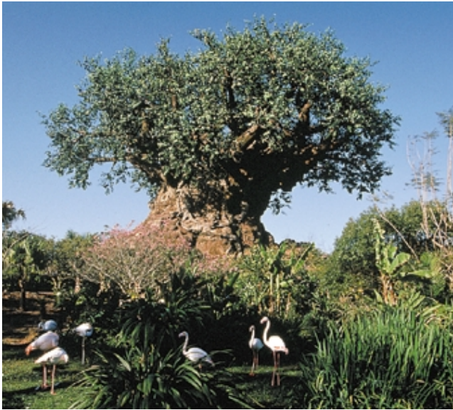
Take your group on safari or find yourself face-to-face with dinosaurs at Disney's Animal Kingdom ® Theme Park.