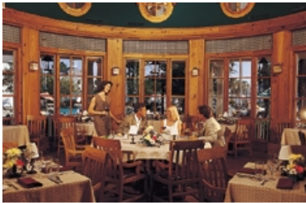
The Yachtsman Steakhouse offers traditional prime cut steaks and chops.

Sail into food and drink at five themed restaurants and four