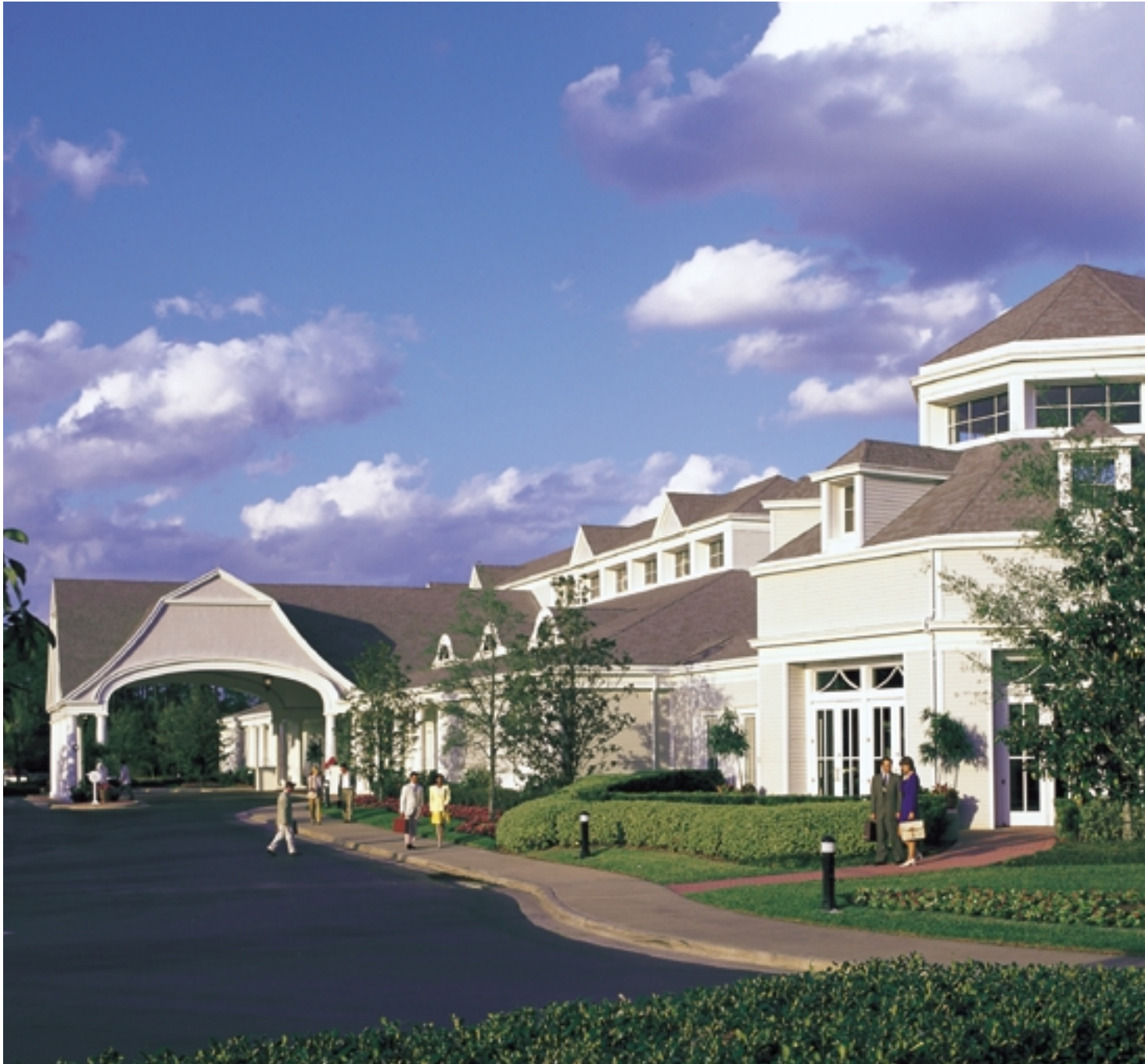
The Convention Center: 73,000 square feet of flexible meeting space is designed for maximum efficiency.