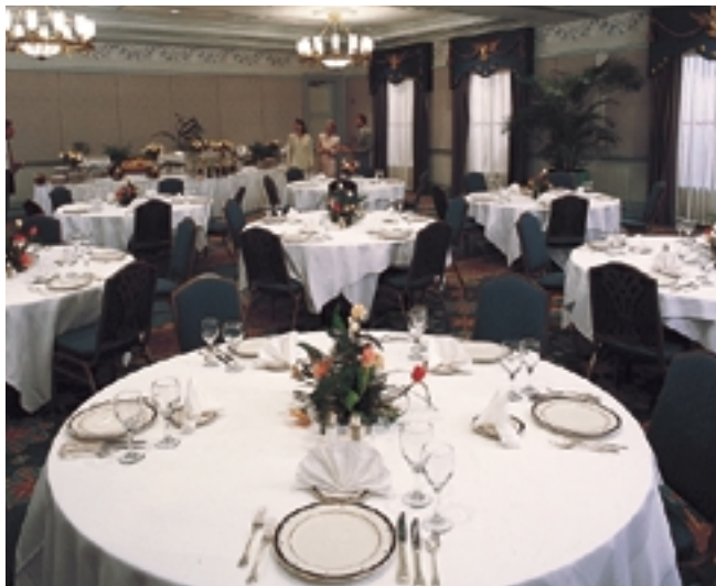
The Cape Cod Hall offers flexibility for groups up to 384.

At your next function, we can help you present a stage show,