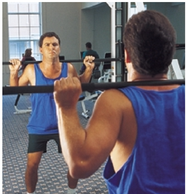
Stay shipshape at our fully-equipped health club.