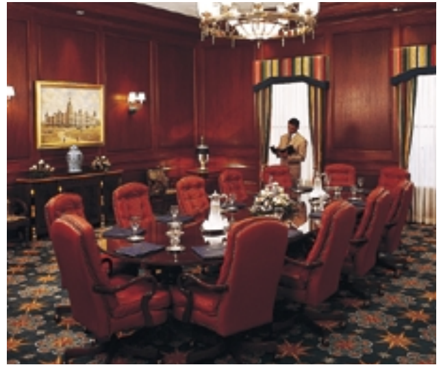
Executive meetings are perfect in the Stonington Boardroom.

It's Impossible To Think Small In Space Like This.