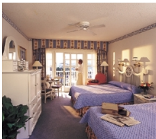
Guest rooms offer a wide variety of scenic views.

Return with us to the turn-of-the-century atmosphere of a quaint east coast sea-side community: Disney's Yacht & Beach Club Resorts. These charming resorts on Crescent Lake are an easy walk or boat ride to Epcot ®, and a quick water-taxi ride to Disney-MGM Studios Theme Park. Our 1,217 guest rooms and suites are spacious and beautifully appointed. And both resorts are connected to their 73,000 square-foot Convention Center.