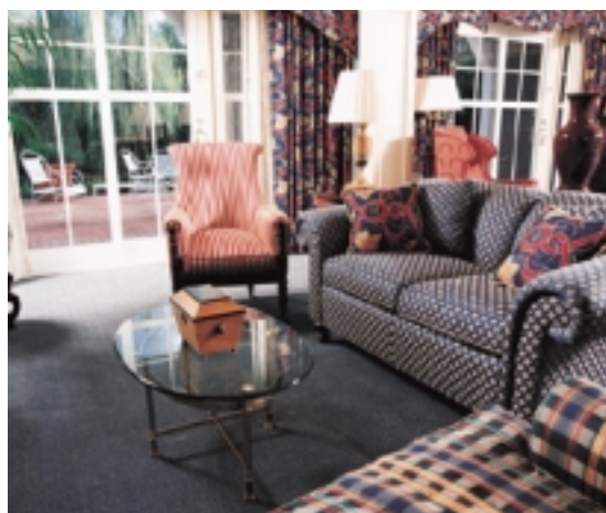
The Captain's Deck: the perfect hospitality setting.