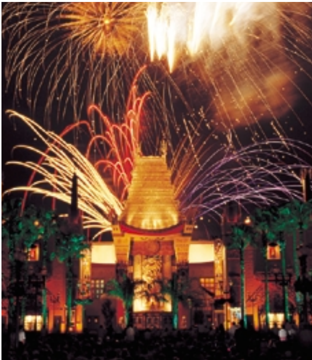
Host a Hollywood gala at the Disney-MGM Studios. See actual movies and TV shows in production and experience some of the most creative private themed events.