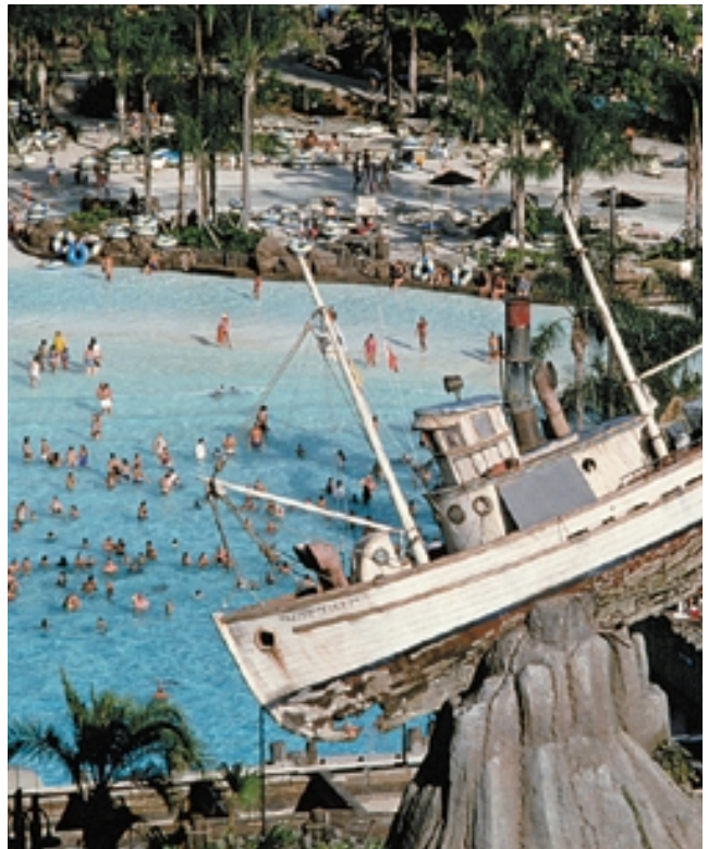
Jump in – everything's fun at Disney's three incredible water parks. Your group can ride the slides, waves and rapids, or just relax on sandy beaches.