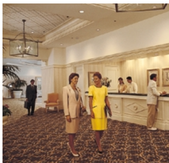
Convenient built-in convention registration.