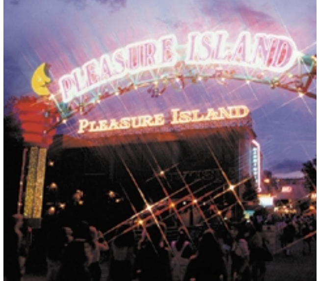
At Downtown Disney Pleasure Island your group is in for non-stop fun: spectacular nightclubs, stage shows, and nightly New Year's Eve celebrations.