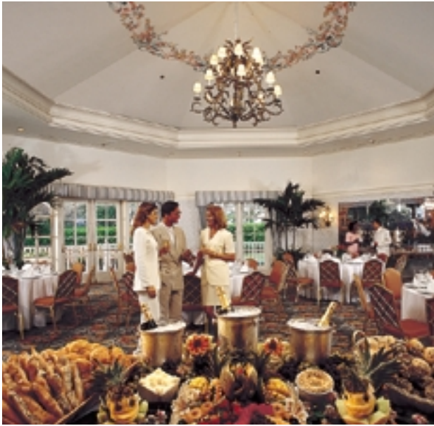
A banquet in Whitehall: stimulation for both mind and palate.

Rest assured, every detail of your next meeting or event will be handled to exceed your