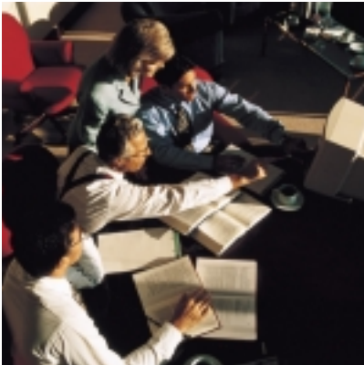
21st-century technology at your fingertips.