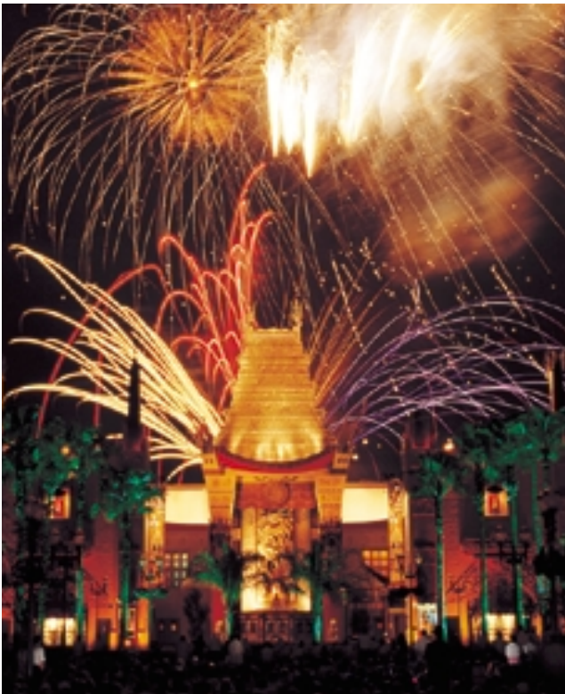
Host a Hollywood gala at the Disney-MGM Studios. See actual movies and TV shows in production and experience some of the most creative private themed events.