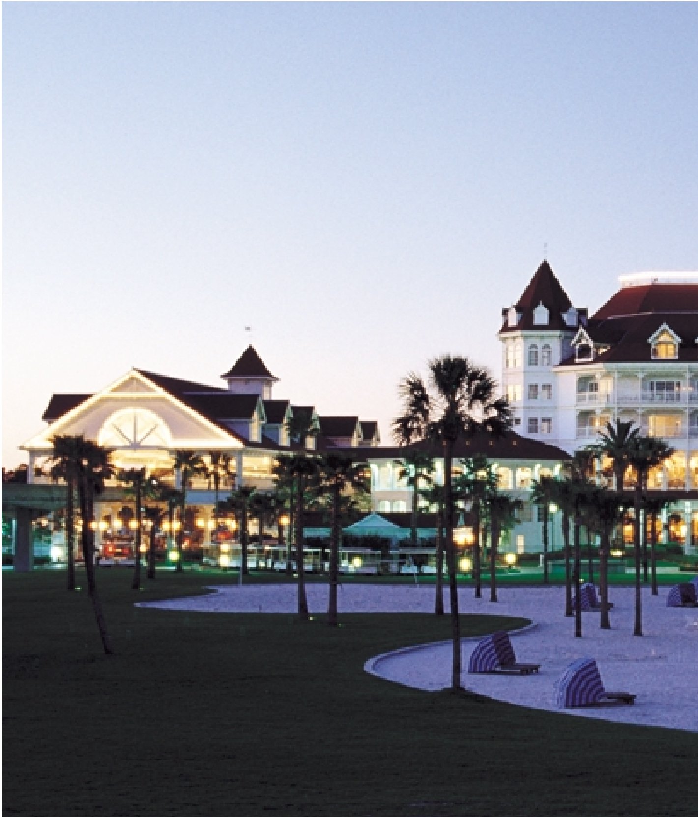
Our white sand beach along Seven Seas Lagoon.