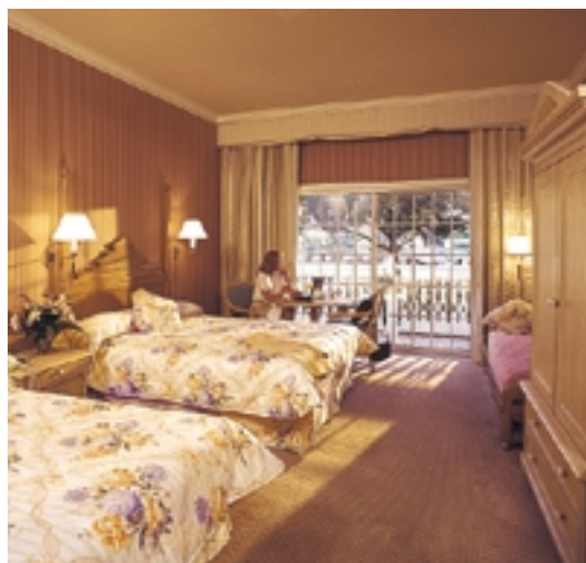
Our spacious guest rooms will make you feel right at home.