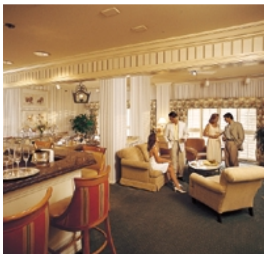
The Cape Coral Suite provides a view of Cinderella Castle.