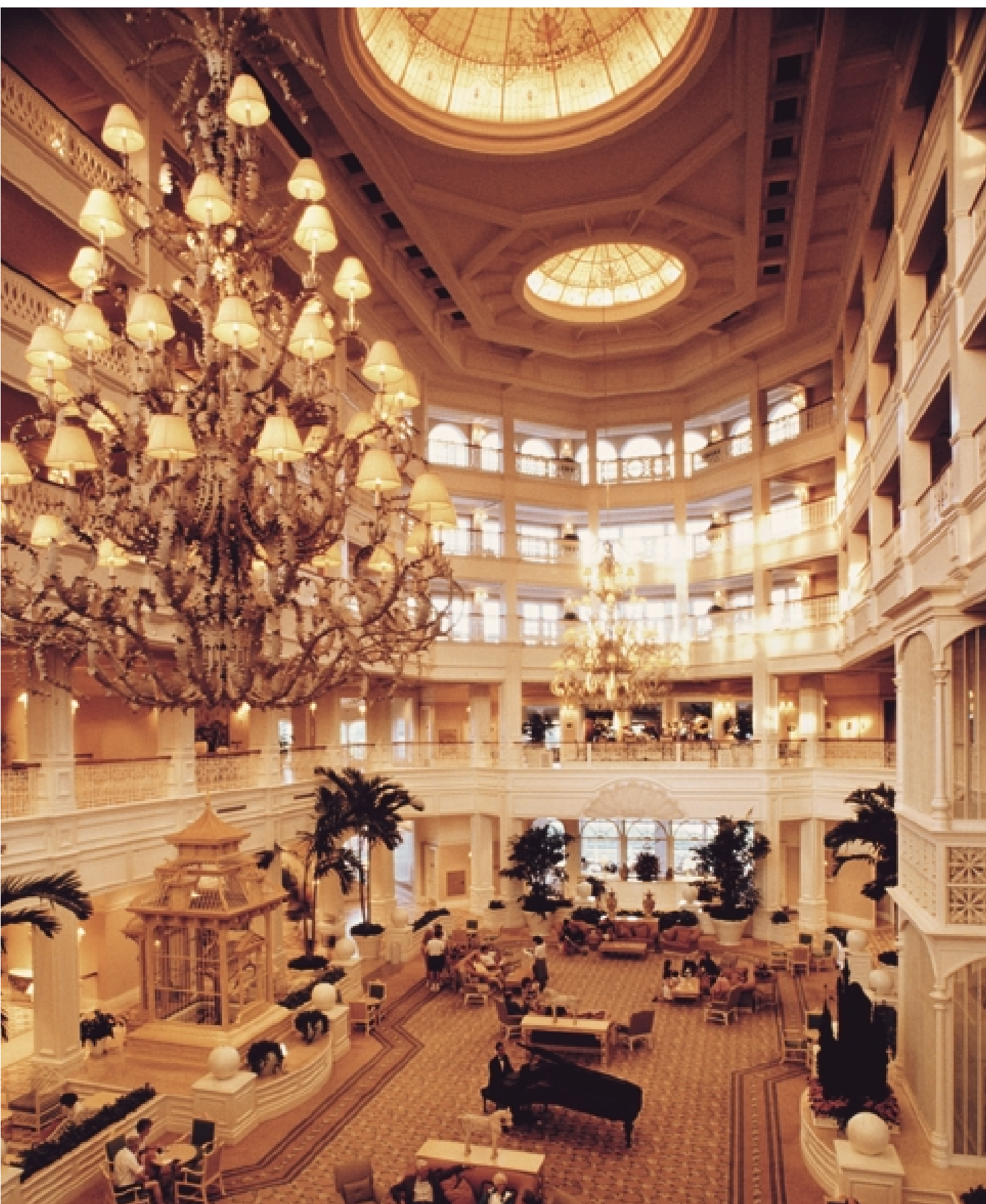
The elegance of the Grand Lobby welcomes you and your guests.