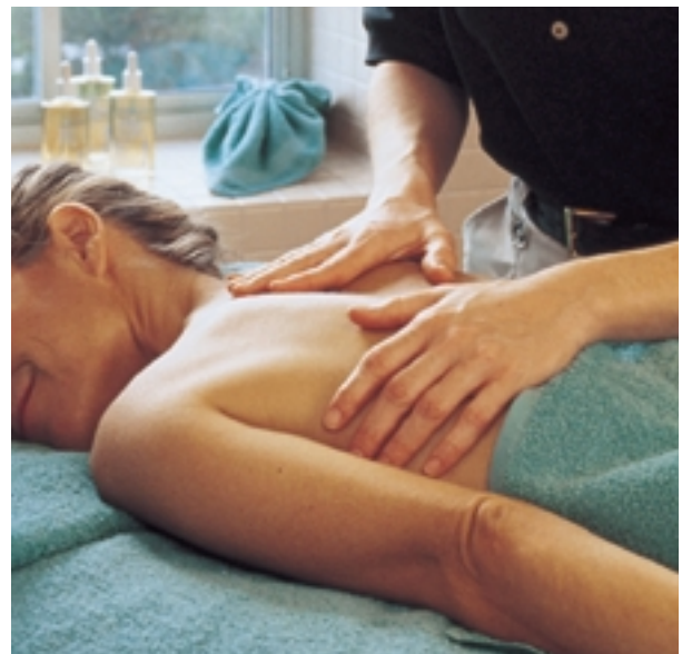
Our spa and sauna take the kinks out.