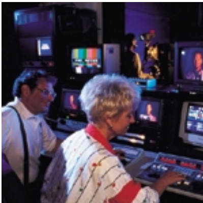
We can help make your presentation a smash hit.

Hold your next conference or convention at Disney's Grand Floridian Resort & Spa, and you'll enjoy exclusive benefits available only to Walt Disney World® Resort