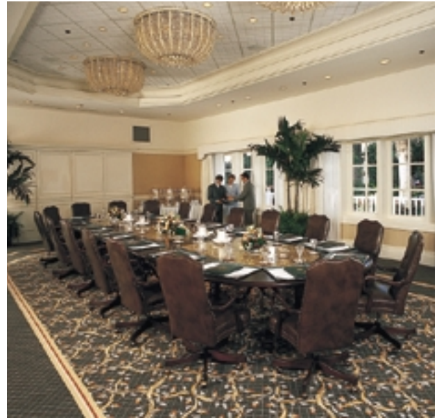
The Palm Beach Boardroom.

We Are Remarkably Flexible, Focused On Service In So Many Ways.