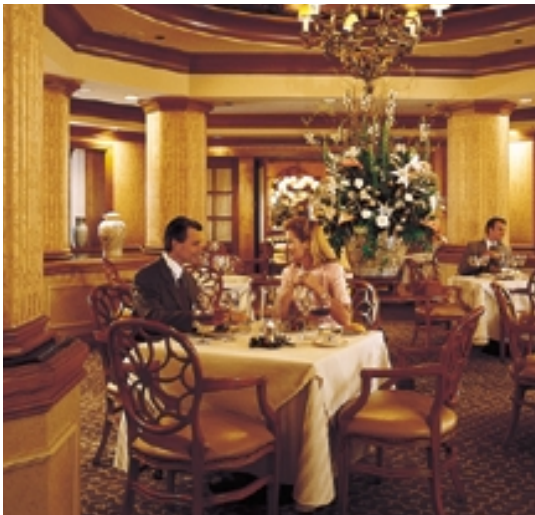
Regal service and cuisine at Victoria & Albert's .

Step into our Grand Lobby and back into Queen Victoria's day: spacious verandahs, crystal chandeliers, an exotic aviary. You'll also find gift and apparel shops, and exceptional concierge service. When it's time to wind down, we offer three cocktail lounges – one by the beach.