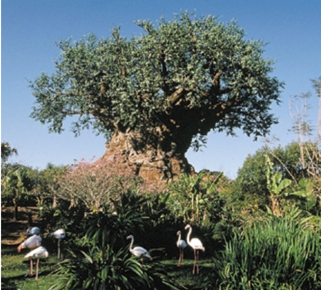
Take your group on safari or find yourself face-to-face with dinosaurs at Disney's Animal Kingdom® Theme Park.