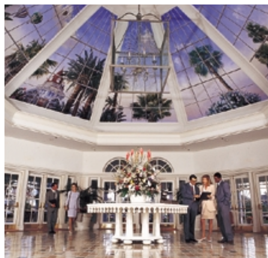
In the Grand Foyer: the sky's the limit.