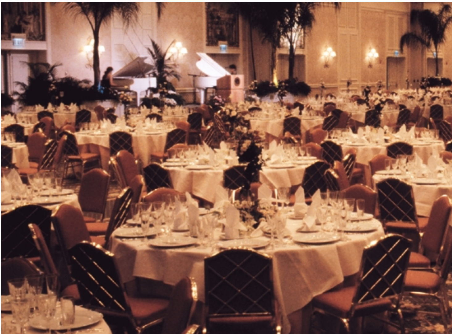
The Grand Floridian Ballroom graciously accommodates up to 1,400 banquet guests.