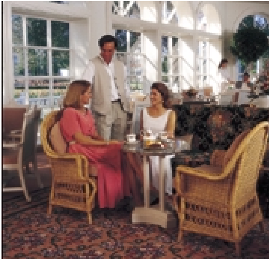
Cocktails and high tea served daily in the Garden View Lounge .