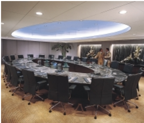
The Contemporary Boardroom seats up to 24 guests.

The meeting, convention and banquet space at Disney's Contemporary Resort offers over 90,000 square feet