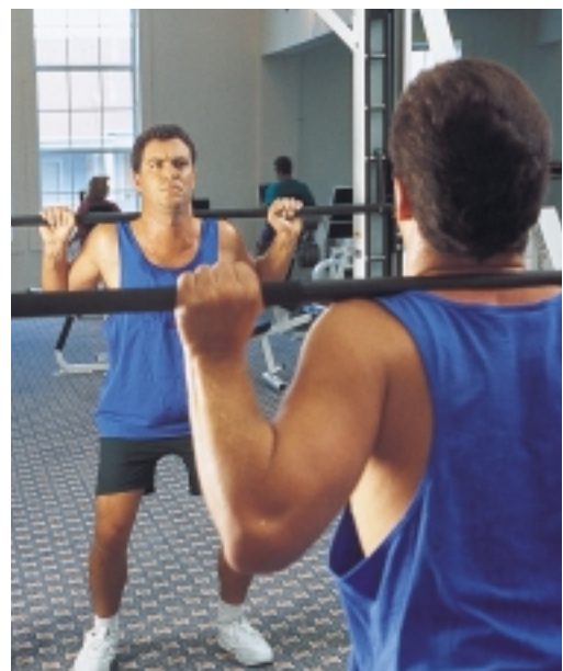
Stay shipshape at our fully-equipped health club.