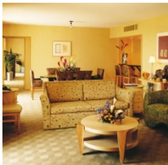
Our suites are ultra-modern, ultra-comfortable.