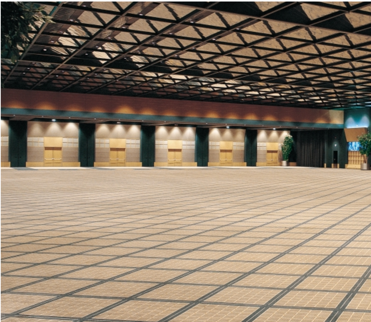
Our Fantasia Ballroom: 44,840 square feet of unencumbered meeting space.