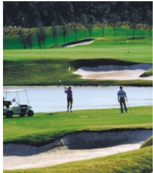
Take a swing at one of Disney's five championship golf courses.