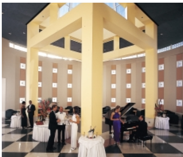
An affair to remember at the West Rotunda.

Your function may be held beneath a skylight or even the sky.