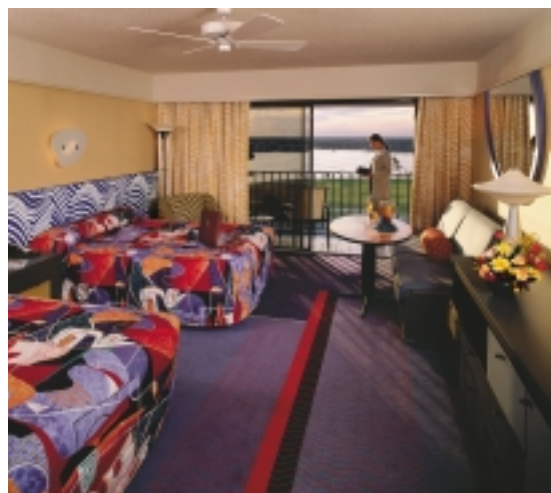
Spacious guest rooms provide beautiful views.