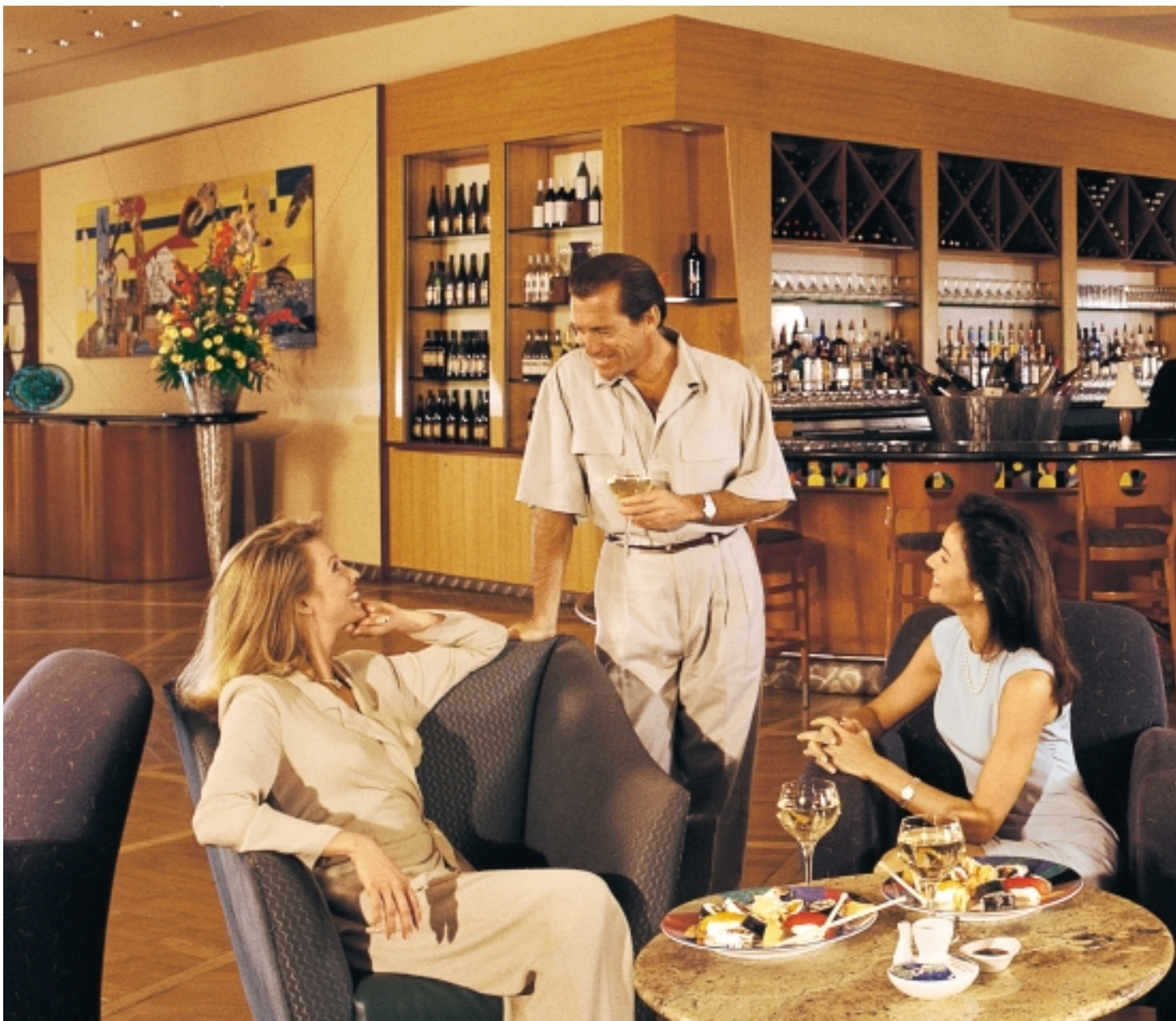
At the California Grill , the panoramic view and incredible cuisine are specialties of the house.