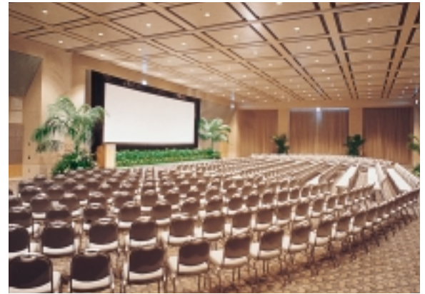
Nutcracker: one of four flexible ballrooms.

We Design Space To Stimulate The Imagination.