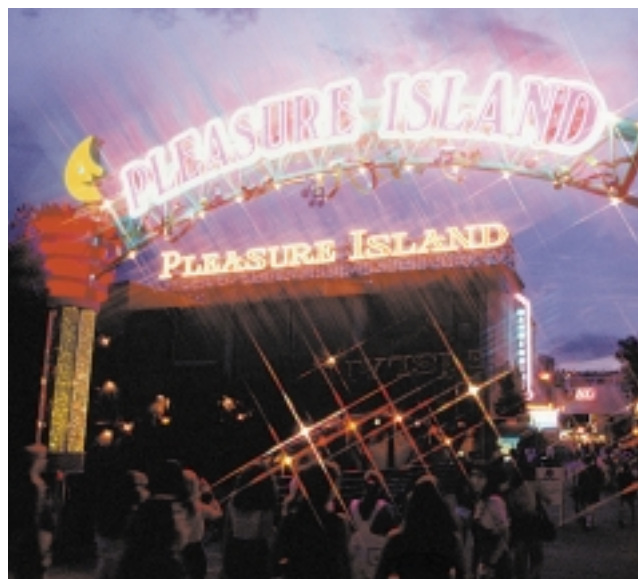
At Downtown Disney ® Pleasure Island, your group is in for non-stop fun: spectacular nightclubs, stage shows, and nightly New Year's Eve celebrations.