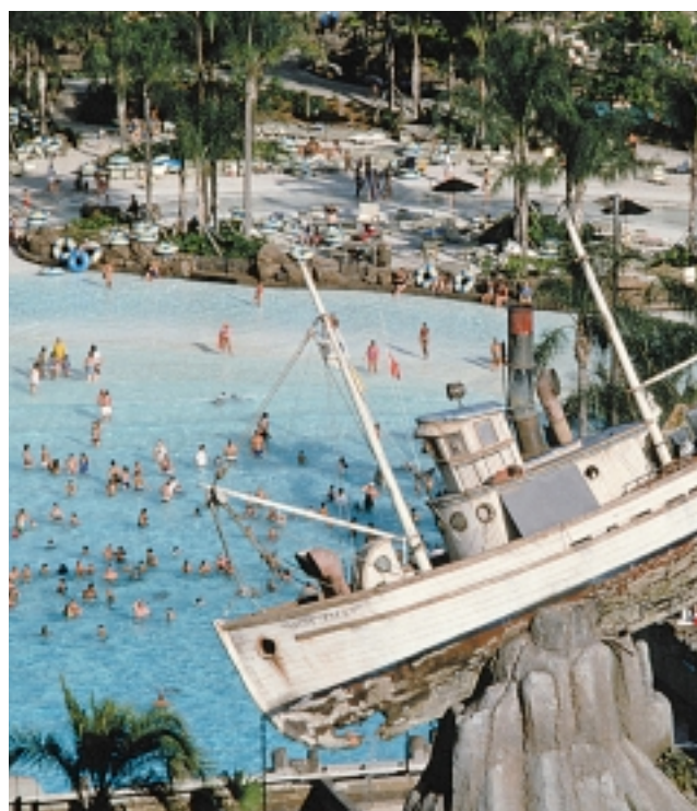
Jump in – everything's fun at three incredible Disney Water Parks. Your group can ride the slides, waves and rapids, or just relax on sandy beaches.