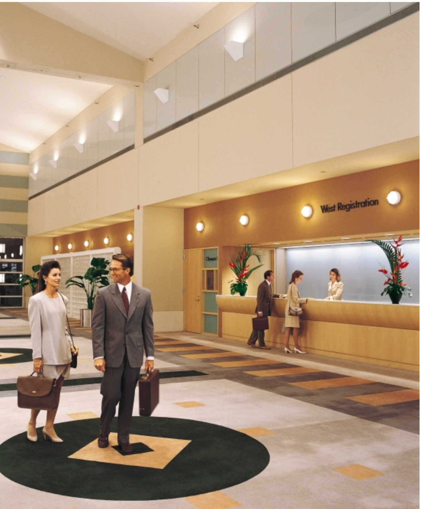
The Convention Center pre-function area features two built-in registration counters.