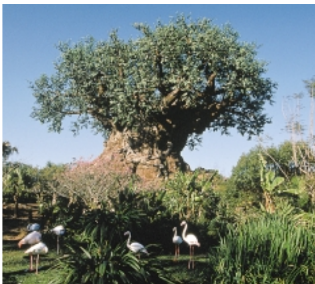
Take your group on safari or find yourself face-to-face with dinosaurs at Disney's Animal Kingdom ® Theme Park.