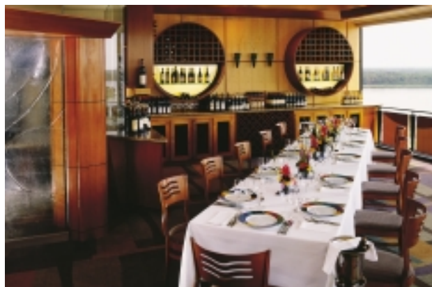
An intimate event at the award-winning California Grill .