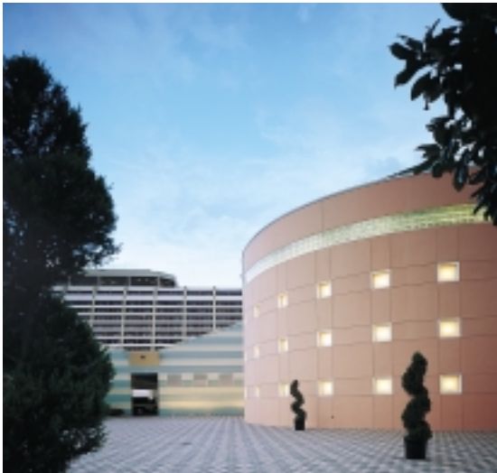
Our Convention Center: over 90,000 square feet of flexible function space.