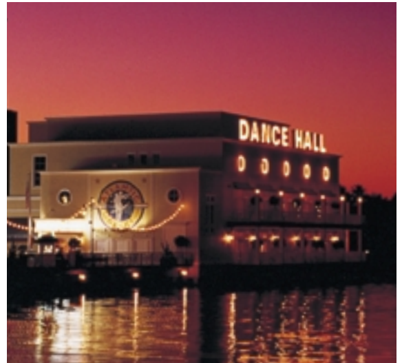
Dance the night away at Atlantic Dance.

Food, Fun And Atmosphere For Every Taste.