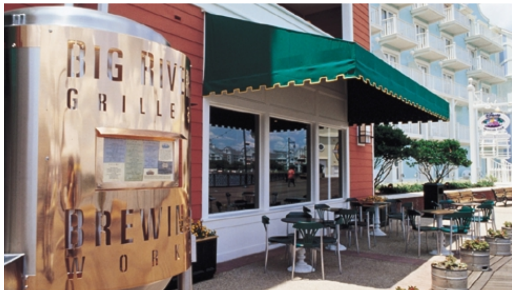
At the Big River Grille & Brewing Works, you'll enjoy a pub-style fare and a festive atmosphere.