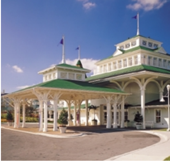
Our 20,000 square foot Conference Center.