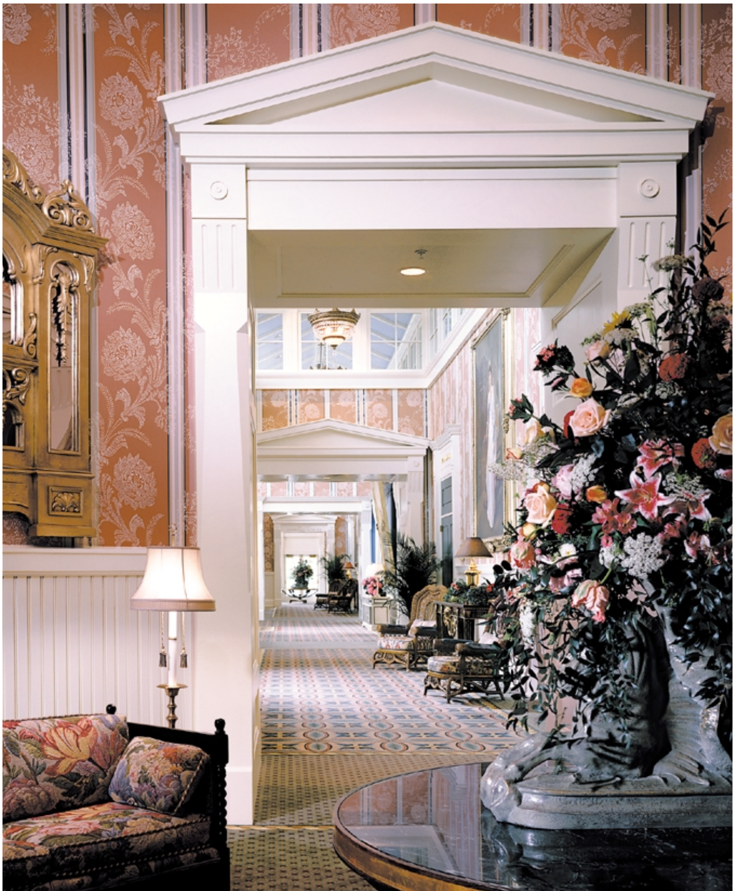
Disney's BoardWalk Conference Center is magnificent and grand, intimate and inviting.