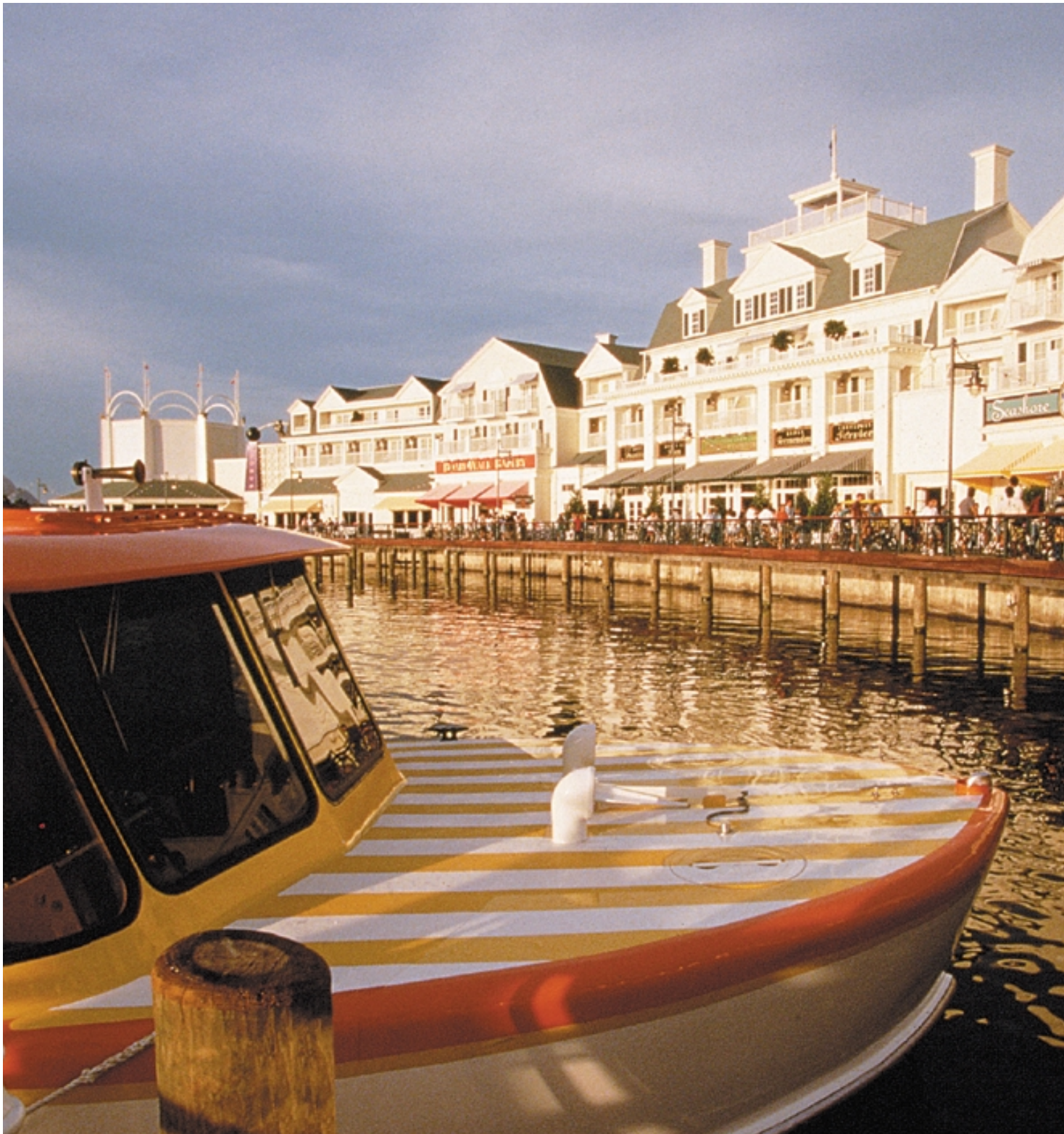
A waterfront village on a lively boardwalk nestled between EPCOT and Disney-MGM Studios.