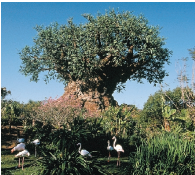
Take your group on safari or find yourself face-to-face with dinosaurs at Disney's Animal Kingdom ® Theme Park.