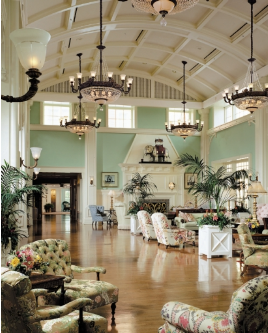
Upon arrival, enter the fantasy and elegance of a 1920's lobby.