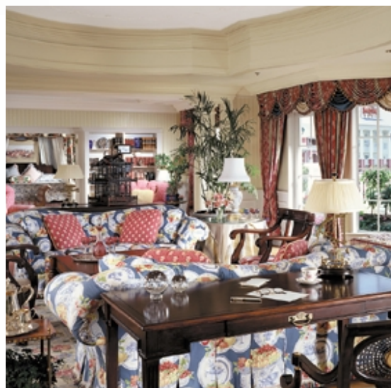
The Steeplechase Suite sets a standard of luxury reflected in all of the suite accommodations.