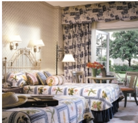
Spacious, beautifully-appointed guest rooms feature balconies or terraces.