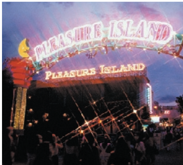
At Downtown Disney Pleasure Island, your group is in for non-stop fun: spectacular nightclubs, stage shows, and nightly New Year's Eve celebrations.