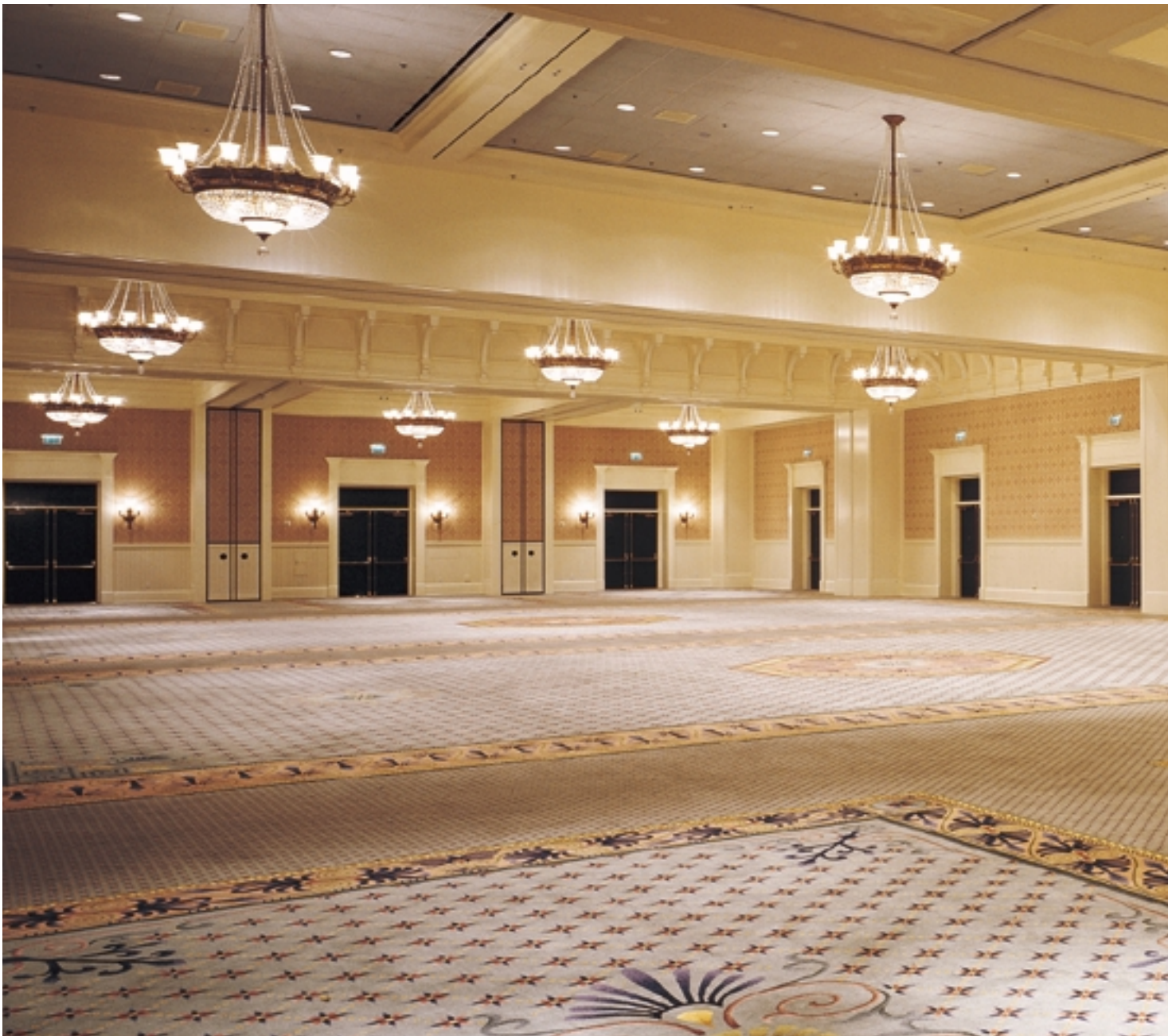
Imagine what you could do with our 10,000 square foot Promenade Ballroom.