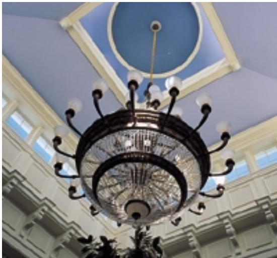
Disney's BoardWalk Conference Center is distinguished by impeccable style and attention to detail.

Disney's BoardWalk Resort offers a distinctive and refreshing setting for your next conference: a 20,000 square