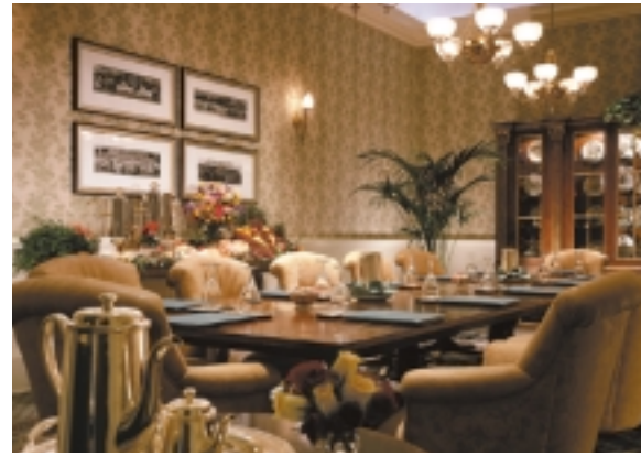
The elegant Park Place Boardroom awaits you.

Our Beautiful Meeting Space Becomes Whatever You Wish It To Be.