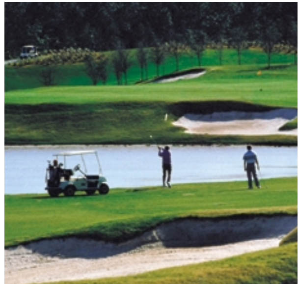
Tee off at any of Disney's five championship golf courses.

There's "Muscles & Bustles", our complete health club; a massage service; two lighted, soft-surface tennis courts; and two 18-hole classic miniature golf courses. So join us just for fun, or for good health – or to wind down after your meeting.