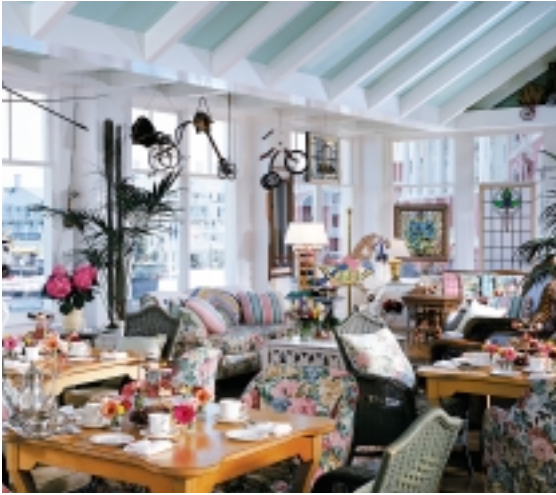
The Members' Attic, ideal for casual gatherings and receptions.