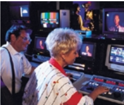
We can help make your presentation a smash hit.

Hold your next conference or meeting at Disney's BoardWalk Resort, and you'll enjoy exclusive benefits available only to Walt Disney World® Resort guests. From a simple business gathering to a large convention, we'll work with you every step of the way to ensure a total success. It's something we call The Disney Difference.