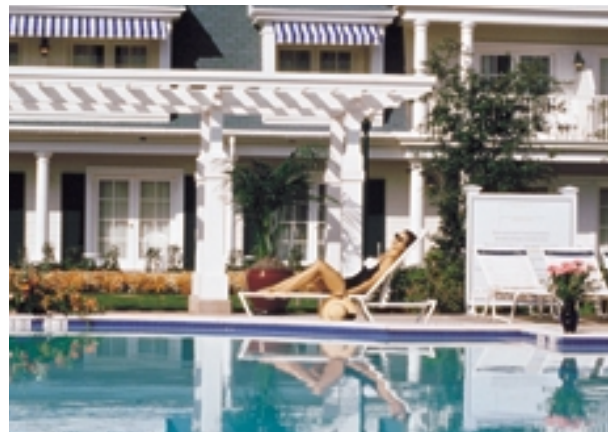
Relax at one of three beautiful pools.