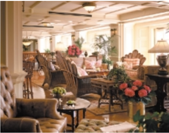
The comfortable Belle Vue Room cocktail lounge in the BoardWalk Inn.

Whether you're in the mood for a spirited group event or an intimate, private gathering, you've come to the right place.