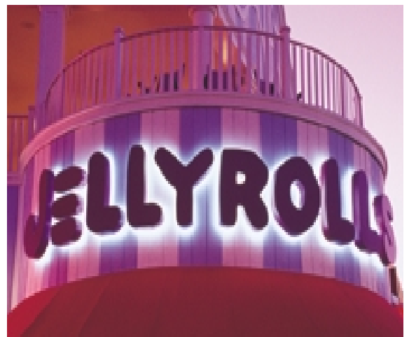
Enjoy cocktails and dueling pianos at Jellyrolls.