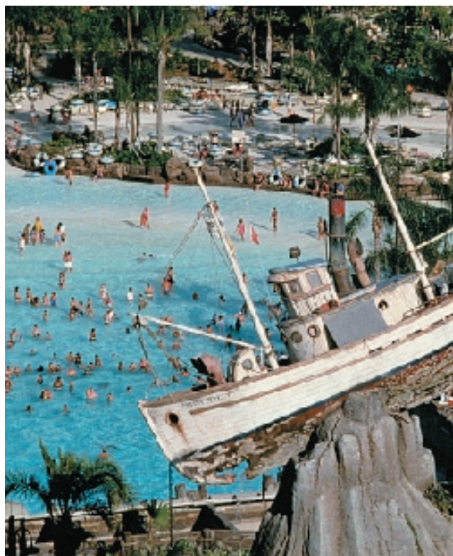
Jump in — everything's fun at Typhoon Lagoon, River Country and Blizzard Beach. Your group can ride the slides, waves and rapids, or just relax on our sandy beaches.