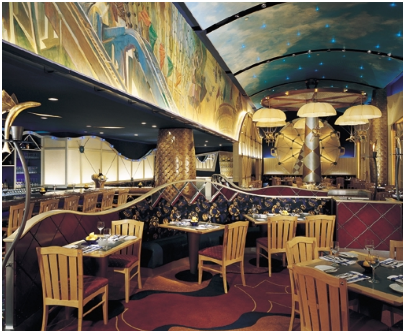
At the Flying Fish Cafe, you'll enjoy sumptuous seafood and steaks. And fantastic decor.