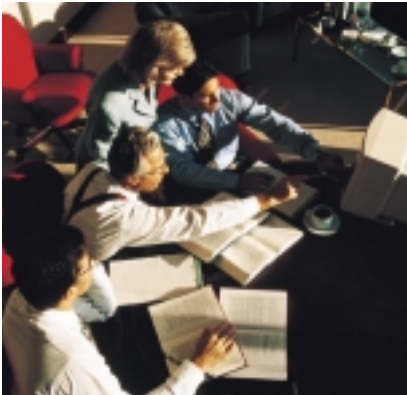
21st Century technology at your fingertips.