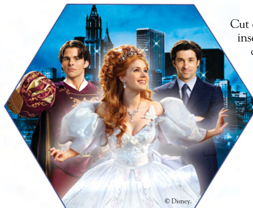
Cut out this image and insert in the bottom of the diorama