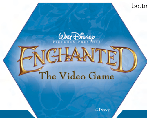
Bottom of diorama