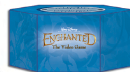
This is what your finished diorama will look like.