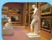
The Metropolitan Museum of Art