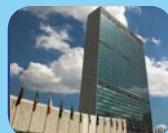
The United Nations