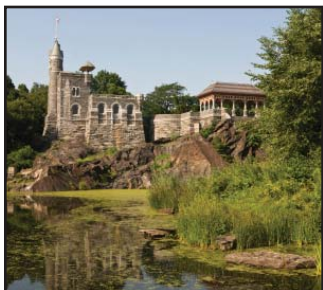
7. REEDELBEV LASTEC