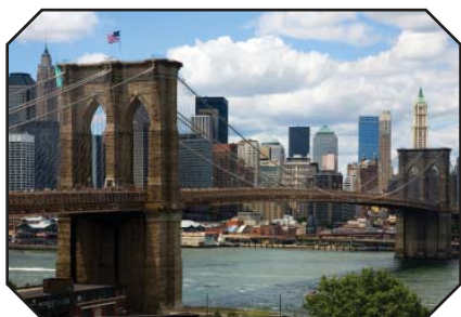
1. YLNOOKRB GEDIBR