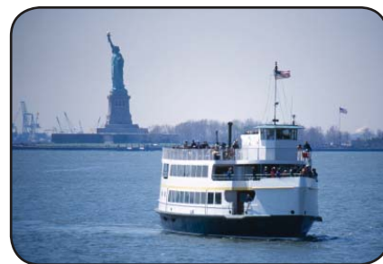
3. NETAST SLADIN YFRER