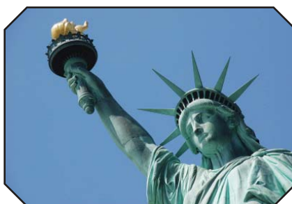
5. ATTUES FO TREYBIL