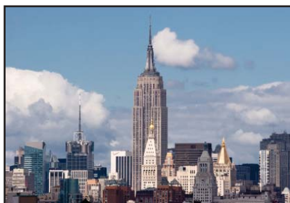
2. MEPEIR ATTES GINULBID