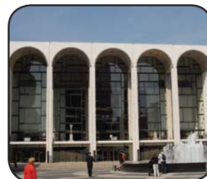
10. CILLNON TRENCE