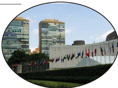
8. HET DENTIU ASONTIN