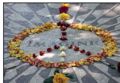
6. WRASTYERRB DLIESF