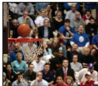
9. AMIDNSO SEQAUR NEGRAD