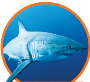
GREAT WHITE SHARK

Large size and hard shell protect it from being eaten, so it doesn't have many enemies as an adult.