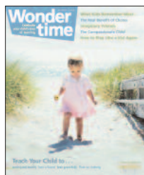
Photograph of Erynn, 21 months